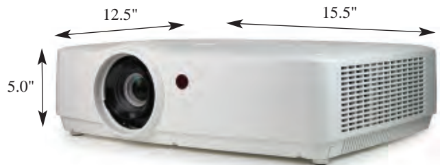
EK-302X • XGA • 3LCD projector.