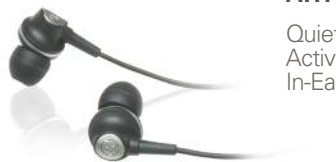
ATH-ANC3 QuietPoint Active Noise-Cancelling In-Ear Headphones