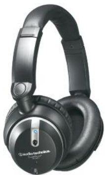
ATH-ANC7 QuietPoint Active Noise-Cancelling Headphones