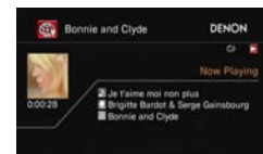
*Sample image of new GUI