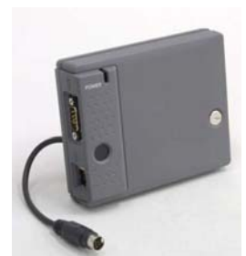
Optional PJ-Net Organizer (POA-LN01)