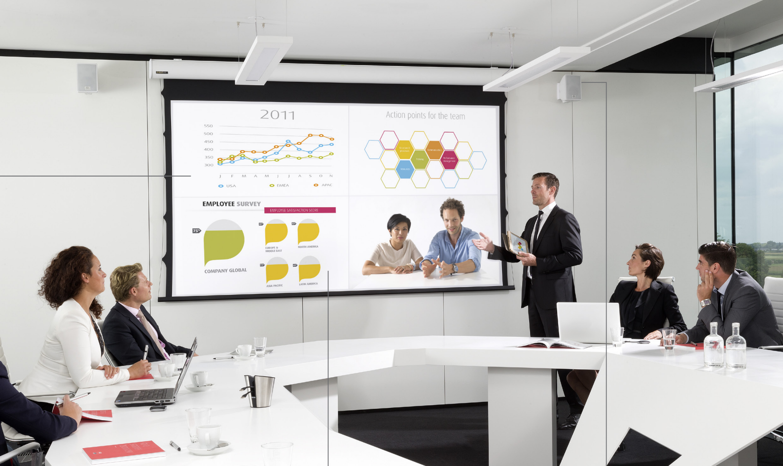
Up to 4 people on screen simultaneously