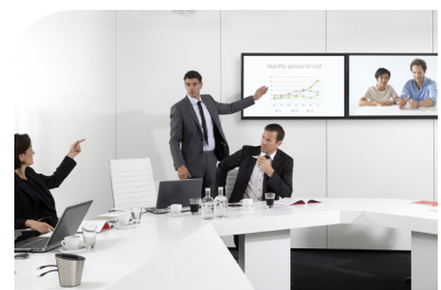
Dual screen support