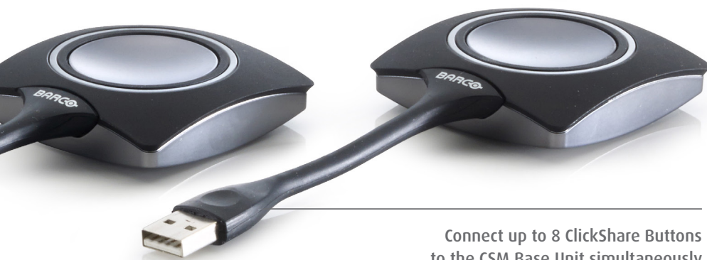
Connect up to 8 ClickShare Buttons to the CSM Base Unit simultaneously