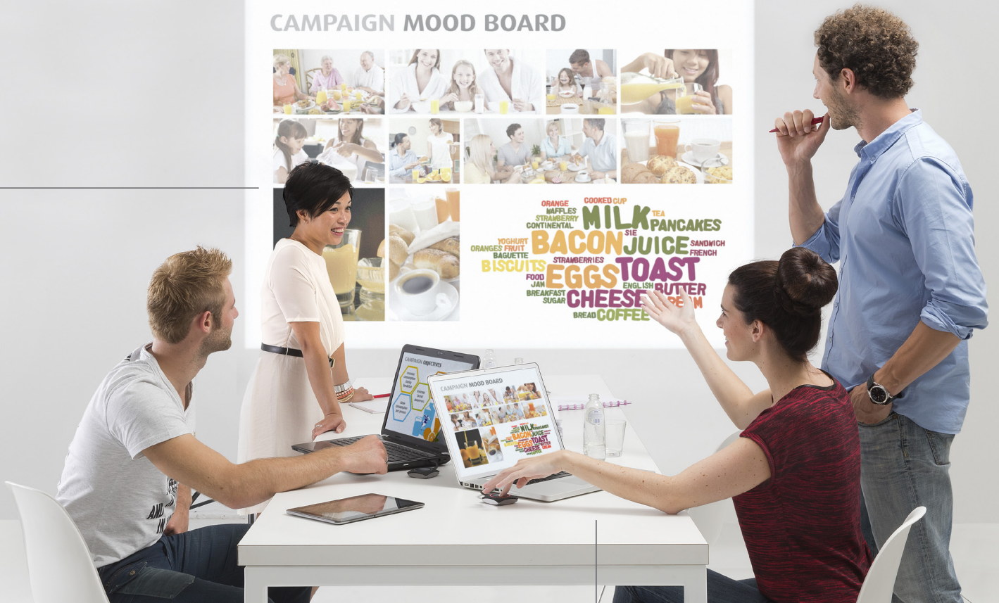
One user sharing on screen