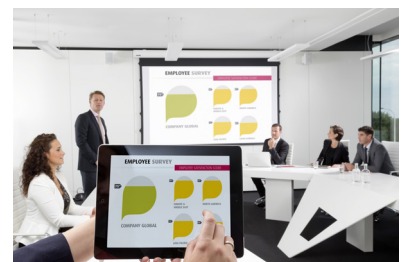
Show dynamic content from iPads and iPhones using ClickShare Link