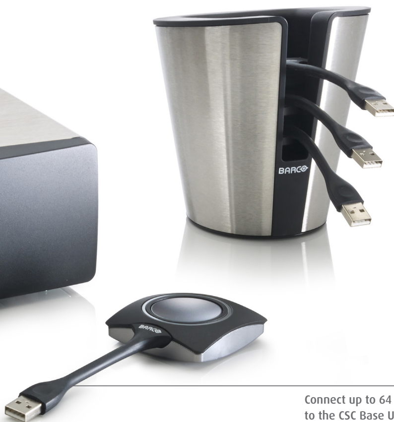
Connect up to 64 ClickShare Buttons to the CSC Base Unit simultaneously