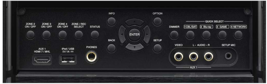
Inside of trapdoor