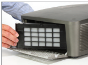
Air filter lasts up-to 13,000 hours.

Replacement Lamp, Wideangle, Midrange and Telephoto Lenses, ATA-Style Shipping Case with Wheel and Telescoping Handle, PjNet Network Interface, Ceiling Mount, Ceiling Post and Plate.