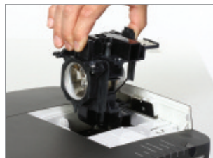
Easy lamp change.