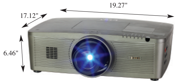
LC-WUL100A • WUXGA • 3LCD projector. (Dimensions shown indicate projector with standard lens).