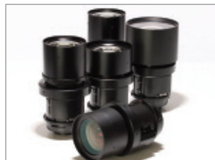
Broad selection of lenses.

Specifications subject to change without notice. ©2013 EIKI International, Inc. Printed in the USA. 09/01/13