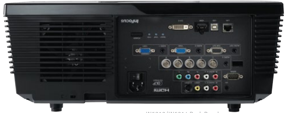
IN5312/IN5314 Back Panel

The 4000 lumens of the IN5314, IN5316HD and IN5318 display crisp, detailed images even in bright rooms. But if even more brightness is needed, you can bump it up to 4500 lumens with the IN5312. Plus, their single-lamp design makes it economical and easy to maintain.