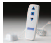
For optional remote control operation, see options on pages 50-54.