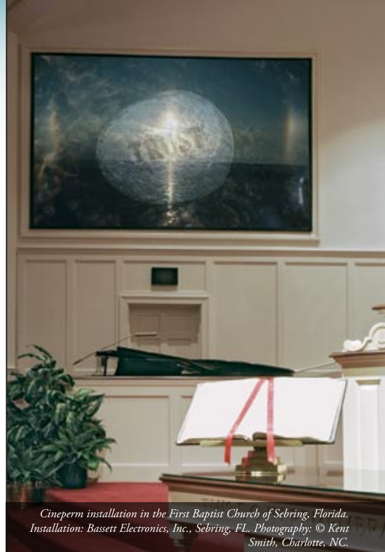
Cineperm installation in the First Baptist Church of Sebring, Florida. Installation: Bassett Electronics, Inc., Sebring, FL.