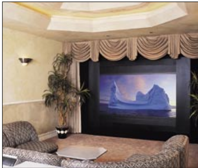
Eclipse/V U.S. Patent No. 5,523,880

From 4:3 NTSC to 16:9 HDTV, or From 4:3 NTSC to 1.85:1 WideScreen