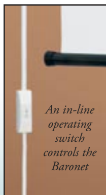
An in-line operating switch controls the Baronet