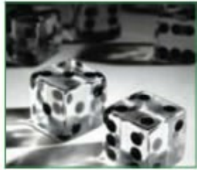
20,000:1 Contrast Ratio