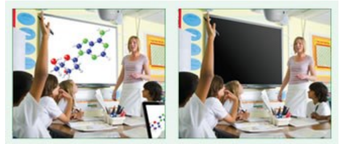
Eco AV mute off 100% power consumption

Stay in control of your presentation with Eco AV mute. Direct your audience's attention away from the screen by blanking the image when no longer needed. This also reduces the power consumption by up to 70%, further prolonging the life of your lamp.