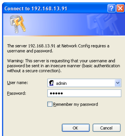
Figure 1 : Login

You will then see a login screen, see Figure 1.