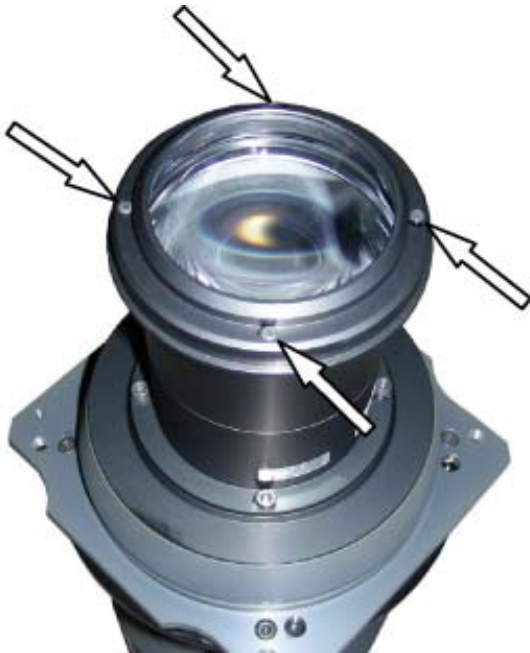
Image 1-1 View of the rear lens element fixation screws

The fixation screws of the rear lens element may become loose due to transportation. This is due to the fact that the used screws are too short.