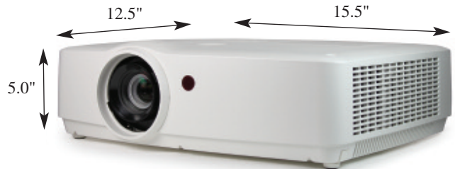
EK-302X • XGA • 3LCD projector.