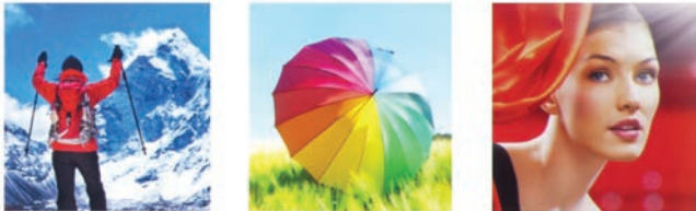
High color brightness and high white brightness