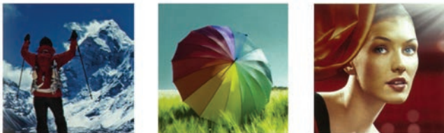
Color brightness significantly lower than white brightness

Actual photographs of projected images from an identical signal source. Price, resolution and white brightness are similar for both projectors (Epson 3LCD and 1-chip DLP competitor). Both projectors are set to their brightest mode.